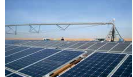
PV Array at Pivot Center

Nine wheel towers carry the pivot's weight and move it. To cross the water supply canal, simple bridges were built.