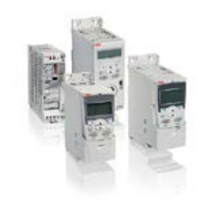
ABB offers a complete range of low-voltage products specially designed to meet any installation requirement. It includes products for switching, control, protection, metering and monitoring, as well as combiner boxes. We are also the largest supplier of components to the inverter OEM market.