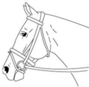
Correctly fitted Flash Noseband